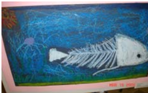
Al Sorrentino, Grade 3—Oil Pastels