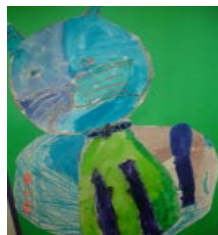
Gabi Silas, Kindergarten—Water Color