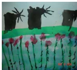
Skyler Rionda, Grade 4—Water Color