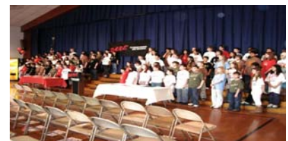
The 2008 D.A.R.E. Graduates