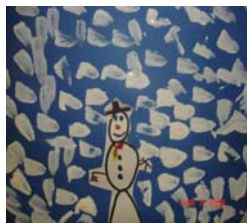
Konrad Stanek, Kindergarten—Mixed Media