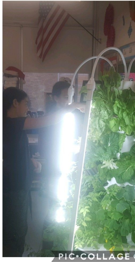
5 th grade students from the Lincoln Park Middle School using produce from their hydroponic tower garden to make healthy salads.